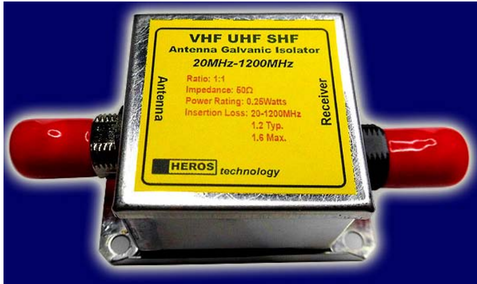
VHF-UHF-SHF Antenna Galvanic Isolator. Suitable for SDR or analogue radios

The broadband antenna isolator allows isolate the antenna galvanically from the receiver; only magnetic signal is coupling from the antenna.